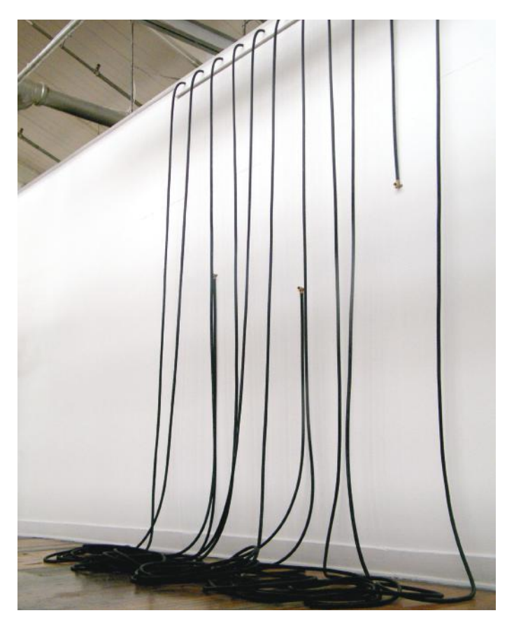
Erased In The Wash!, 2013 200' washing machine hose, brass hardware, audio 14'x 14'x 4'