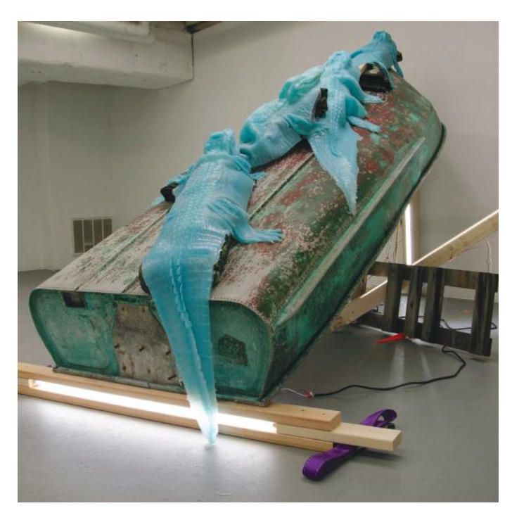
FL2907EL, 2014 Vintage boat, cast silicone alligator skins, wood, moving blankets, rope, T8 fluorescent lights, plastic stake, extension cord 9'x12.5'x10'

My work remains focused on the exploration of the contemporary feminine character based on traditional, political and personal circumstances. The work, post-minimal and conceptual in nature, ranges from two-dimensional and installation to performance and collaborative projects. The content reveals an intimate commentary on a variety of issues of the modern world, the role of women and personal life stories. The choice of execution and materials is essential to accentuate the intent of each particular piece; hundreds of filled plastic garbage bags hung on shower hooks, draped washing machine tubing with sounds of home, paper packages constructed alongside volunteers, intimately photographed domestic portraits, drawings, paintings and interactive public works, all contributing to the larger collective dialogue they are inspired by. The ontological conceptualization of woman continues to unfold in the 21<sup>st</sup> century. Through my work, I strive to create an awareness of how women have been defined in the past and the insight this knowledge gives us as we move forward.