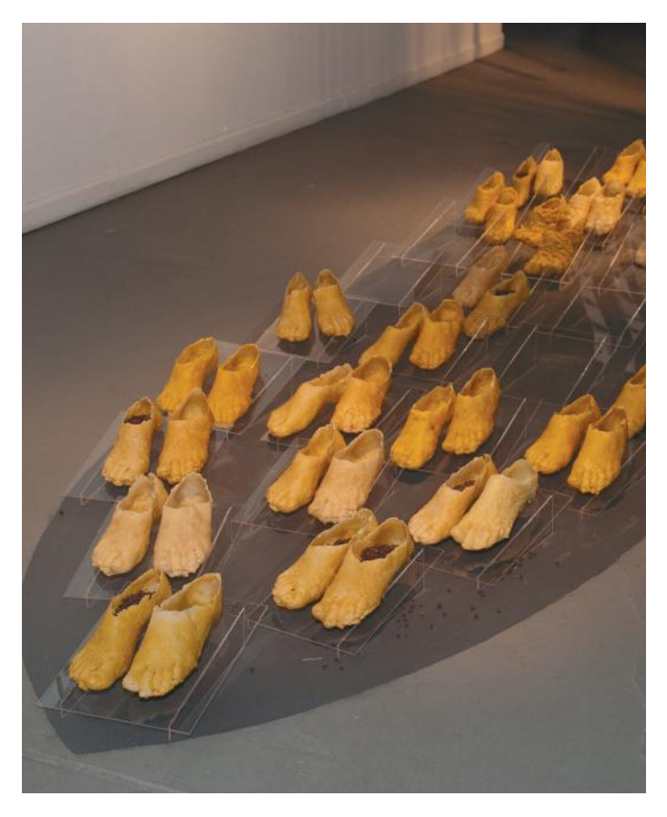
Recollections, 2013 Wax, seeds, fabric, video 12ft x 8ft (floor); 8ft x 8ft wall projection