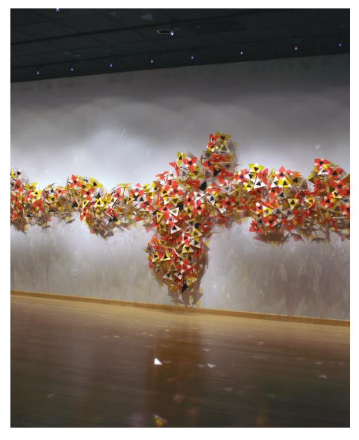
Creeping Ivy, 2013 Hand-cut vinyl, laser-cut acrylic mirrors,wood, steel 20' x 56' x 1.5' (dimensions variable)