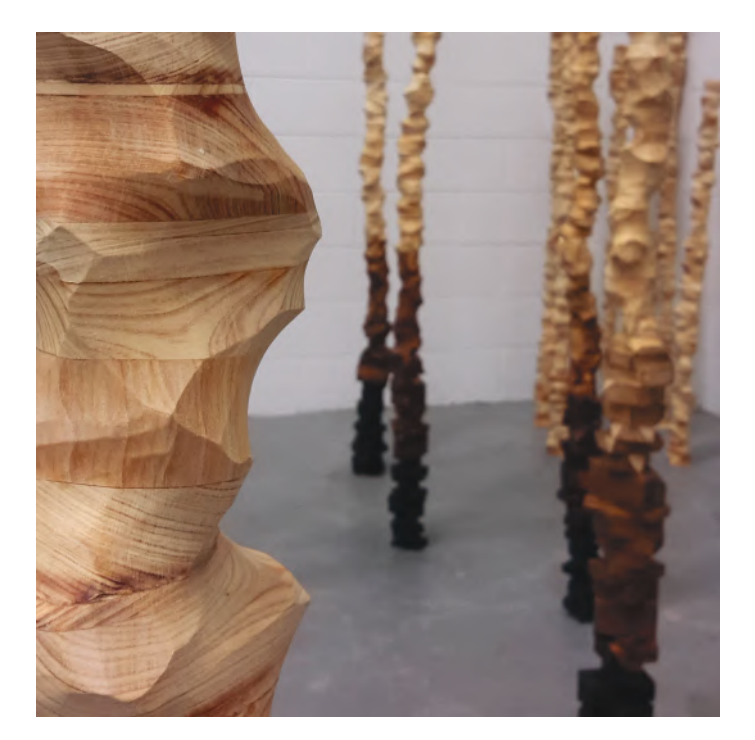
Brokedown Palace, 2014 Cypress wood and Briwax 16 individual pieces with height ranges from 4'-10' and widths of between 2"-4"

The works installed as Recollections are imprints of my own feet painstakingly molded in wax. These 'empty' wax forms are witnesses to the personal and collective void; those spaces in our history made empty by departures of many kinds. Lingering recollections associated with times past are also evoked in this work by the use of pungent allspice seeds filling the voided imprint of the foot. A video plays out on indigo fabric, allowing viewers to enter another ritual of passage or journey as a clay foot is returned to river, the symbol of life flowing without pause.