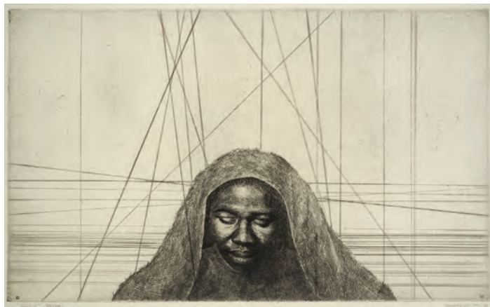
Charles White, Lilly C. , 1973, etching.