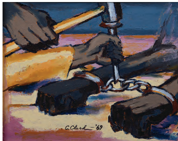
Claude Clark, Self Determination , 1969, oil on board.