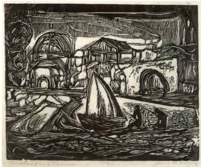
James Lesesne Wells, Sailboat and Fisherman , 1982, woodcut.

Archival framing involves using only archival materials. These materials include foam board, mats, and backings that are 100% acid free. Pressure-sensitive tape should also be used to preserve the integrity of the artwork. The artwork should