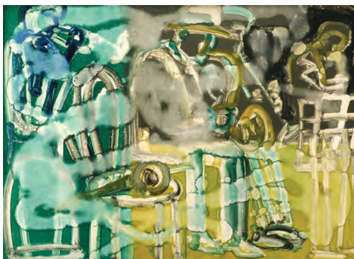
Romare Bearden, Record Date , 1979, monotype, 29.5 x 41.5. Photograph by Gregory Staley. © Romare Bearden Foundation/Licensed by VAGA, New York, NY.