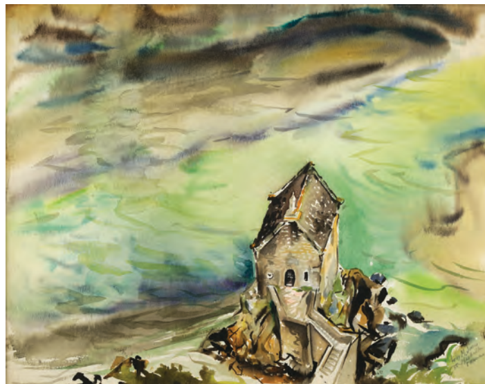
Lois Mailou Jones, St. Michelle, France, 1958, watercolor.

Activity: Show students the cover of Radiant Child: The Story of Young Artist Jean-Michel Basquiat . Ask them, “What does this image tell you about Jean-Michel Basquiat?” Have students complete the “before reading” sentences on the following page. Read Radiant Child together or individually, then complete the “after reading” sentences. How do their answers for each compare? Lead a class discussion using the following questions as a guide: