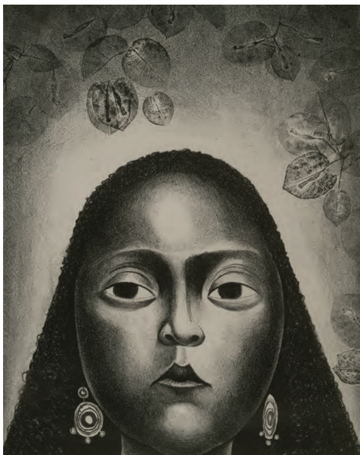
Elizabeth Catlett, Prissy, 1979, lithograph, 18 x 15.