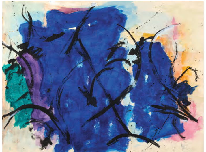
Alma Thomas, Untitled , 1961, watercolor.