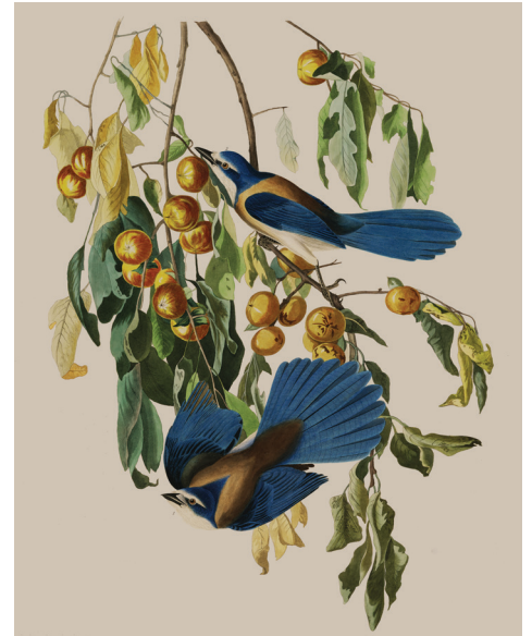
John James Audubon (American, 1785-1851), "The Florida Blue Jay," 1830, copperplate engraving with hand coloring, 35 1/2 x 28 1/2