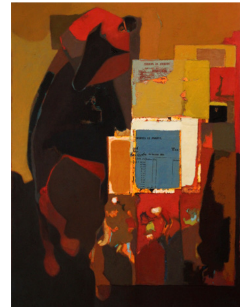
Charles Eady. "American Jockey," 2021. Oil, acrylic, ink, and collage on canvas. Gift in honor of the early American Jockeys.

For the full list of 2021-2022 acquisitions, gifts and purchases, see the Addendum.