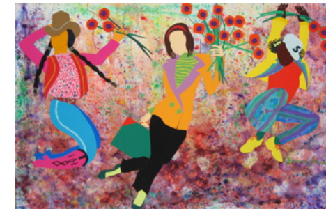
Miriam Schapiro (American-Canadian, 1923-2015), "Celebrating Women's Lives," 1986. Mixed-media collage on canvas. Aid for the Arts.