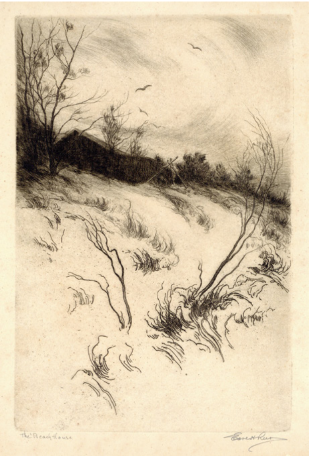
Earl Howell Reed, “The Beach House,” 20th century, Soft ground etching on paper, 11.75 x 7.75 in. Donated anonymously to the museum.