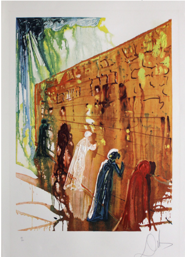
Salvador Dalí, “Wailing Wall,” 1975 (printed), Embossed lithograph, 22 x 29 3/4 in. Anonymous donation.

April 12, (Online) Art 101, Spring Acrylic Painting