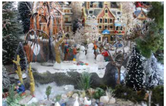
The Dickens Village miniature by Department 56.

In addition to ornately decorated trees, see the architecture, customs and history of Victorian England come alive in the popular Dickens Village miniature. Also on display, an extensive collection of nutcrackers from all around the world and handmade Byers’ Choice caroler dolls. The display is different every year. We encourage you to visit, even if you've enjoyed this display in the past, and to bring your holiday guests.